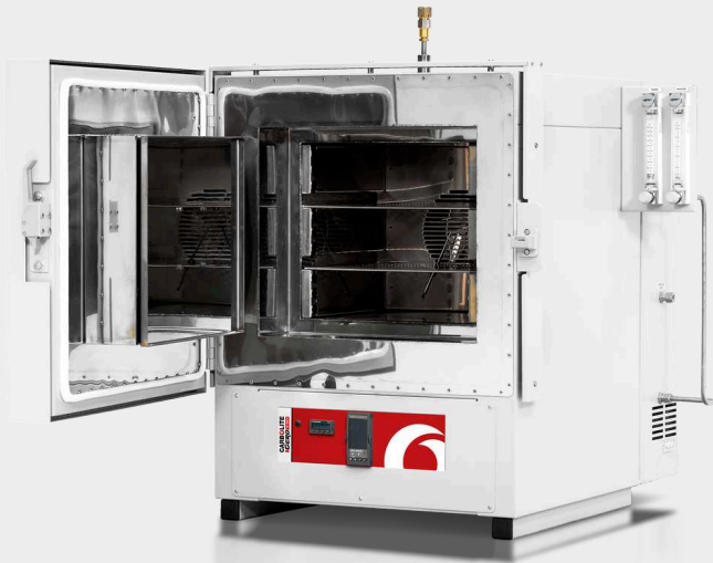
HTMA 6/28 with 3508PI programmer and automatic gas control options