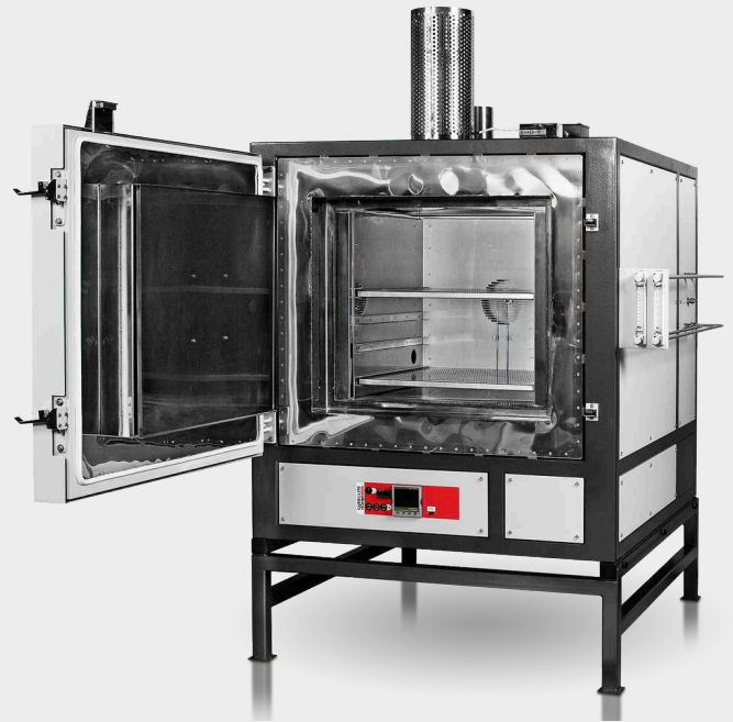
HTMA 6/220 with nanodac programmer, automatic gas control and oxygen monitoring options