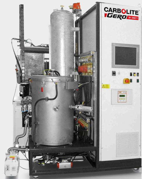
LHTW 200-300/22-1G automat până la 2200°C cu sistem de hidrogen opțional