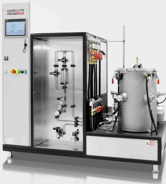
LHTM/W 200-300 Smart