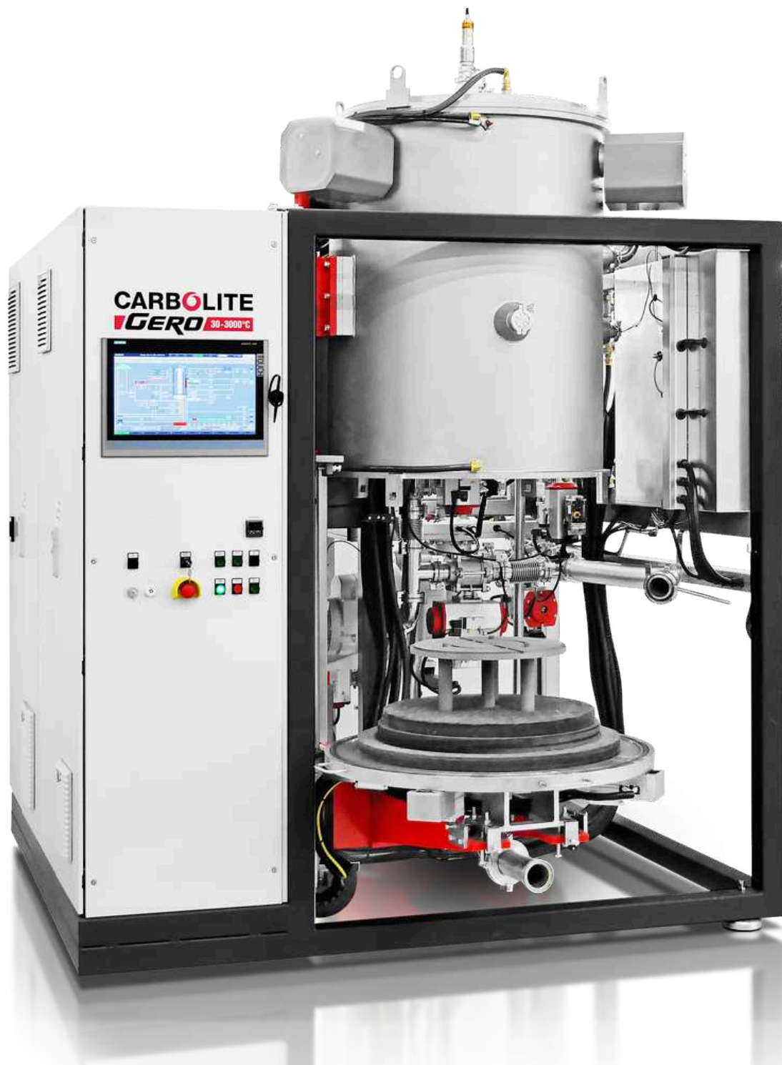
HTBL MO/W - CUPTOR CU ÎNCĂRCARE INFERIOARĂ, IZOLAȚIE METALICĂ