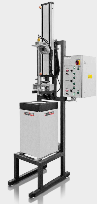
Štandardná Bridgmanova pec do 1800 °C