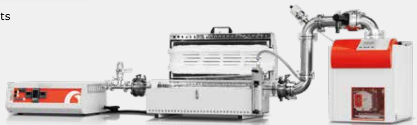
Carbolite Gero HZS 12/600