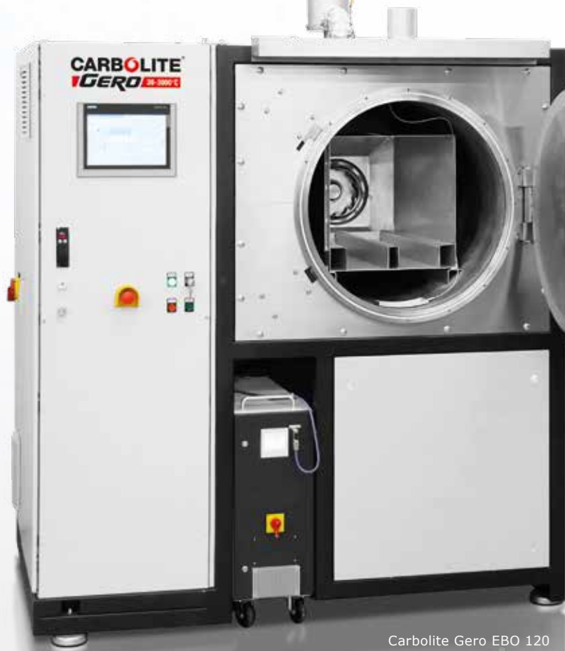
Carbolite Gero EBO 120