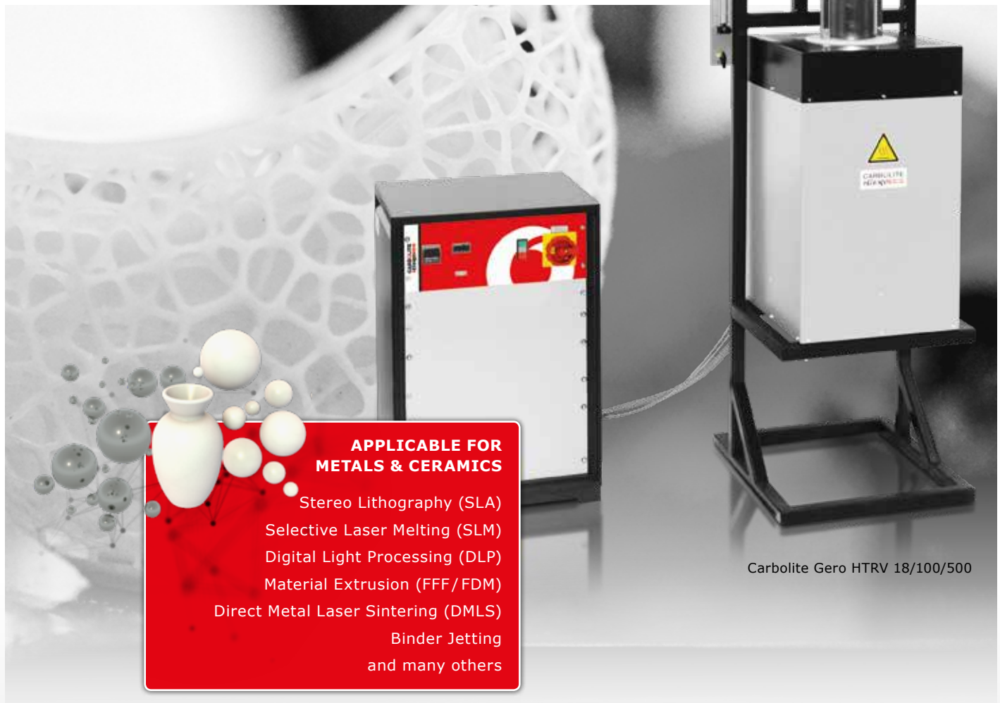
Carbolite Gero HTRV 18/100/500