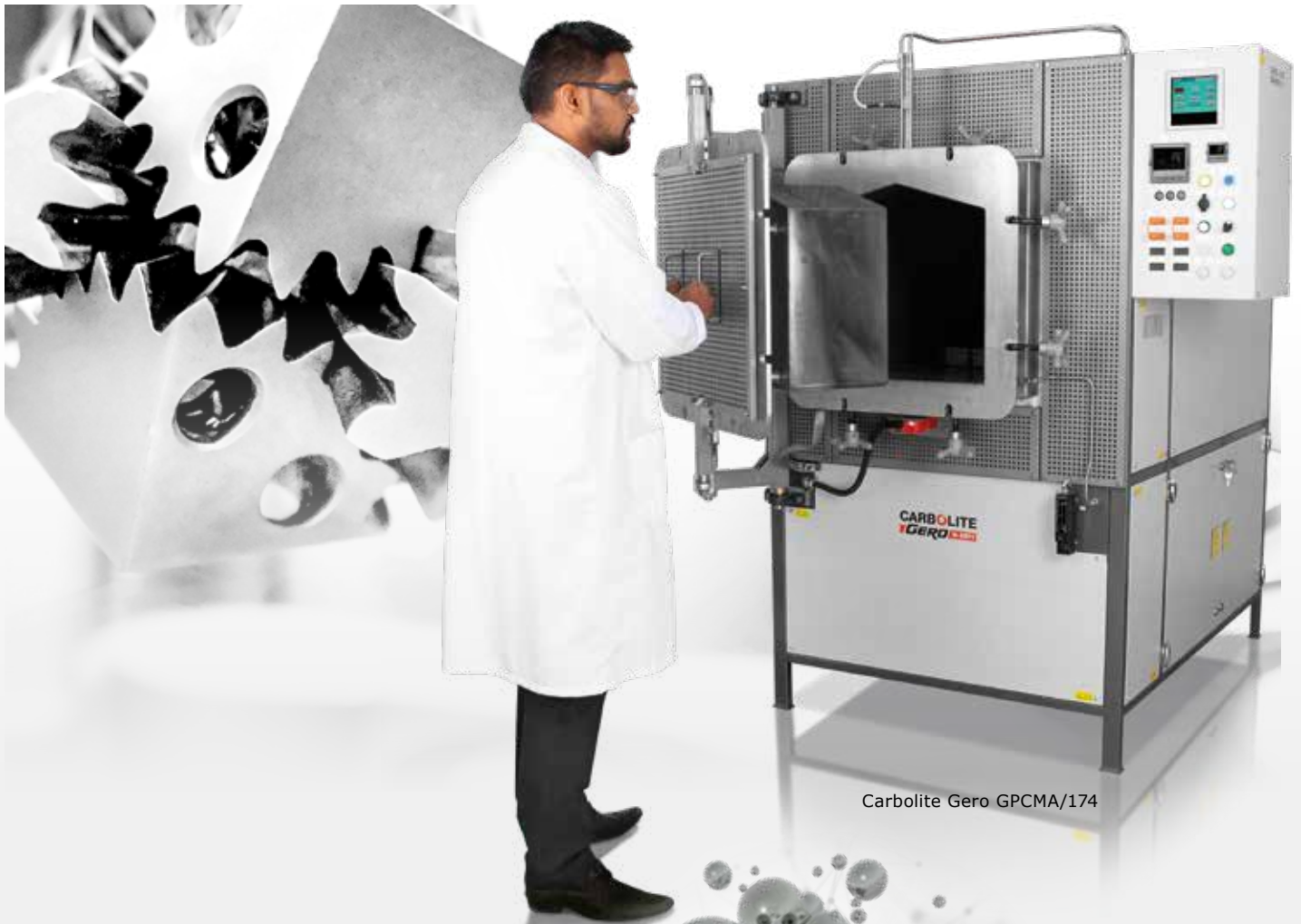
Carbolite Gero GPCMA/174