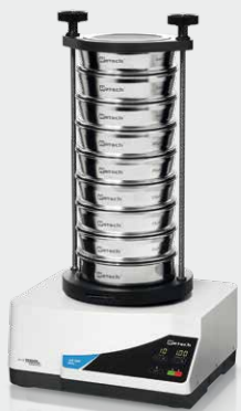
The vibratory sieve shaker AS 200 basic is suitable for separating metal powders into size fractions