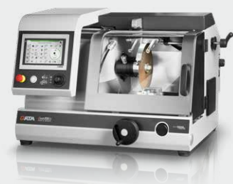
Cutt-off machine Qcut 200 A