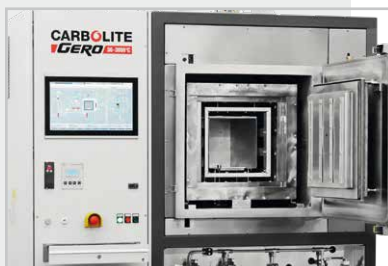
View into the furnace chamber of the HTK vacuum furnace