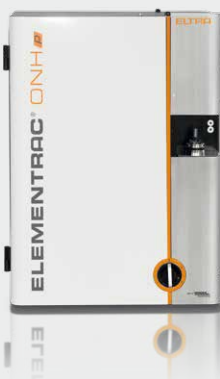
Oxygen / Nitrogen / Hydrogen Analyzer ELEMENTRAC ONH-p 2